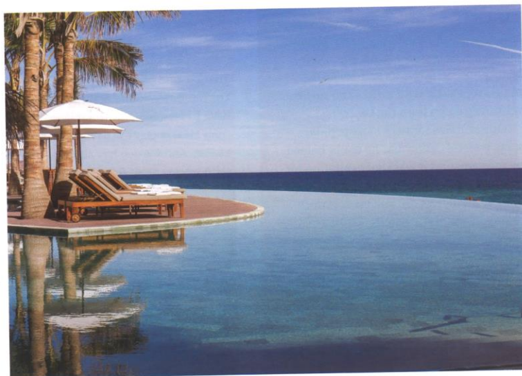
ABOVE LEFT AND BELOW: Cabo San Lucas LEFT: Grand Velas Los Cabos