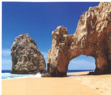
ABOVE: El Arco of Cabo San Lucas LEFT: Sea lions

to the area and to the nearby La Lobera sea lion colony, where you can swim alongside these sociable mammals and their pups. They also run diving courses and whale-watching excursions, recently counting Batman Begins star Christian Bale among its clientele.