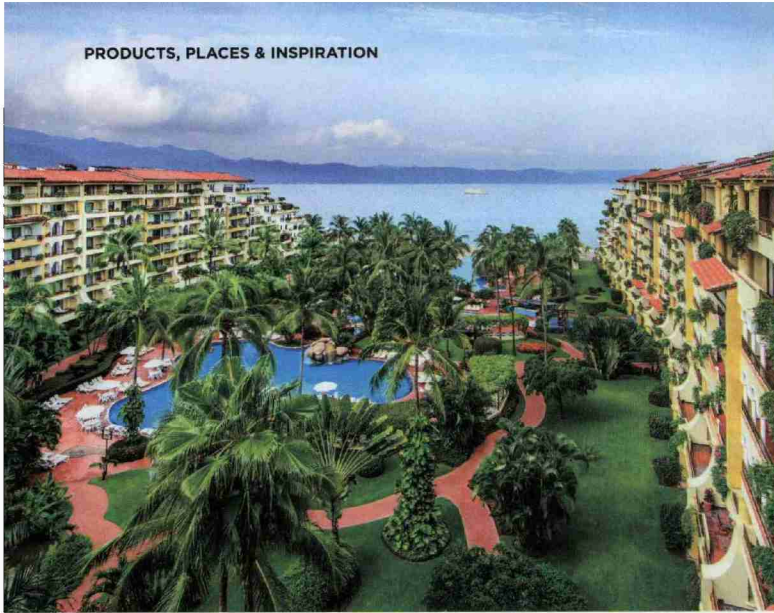
PRODUCTS, PLACES & INSPIRATION